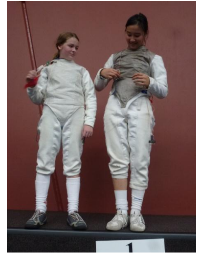
First and second place winners