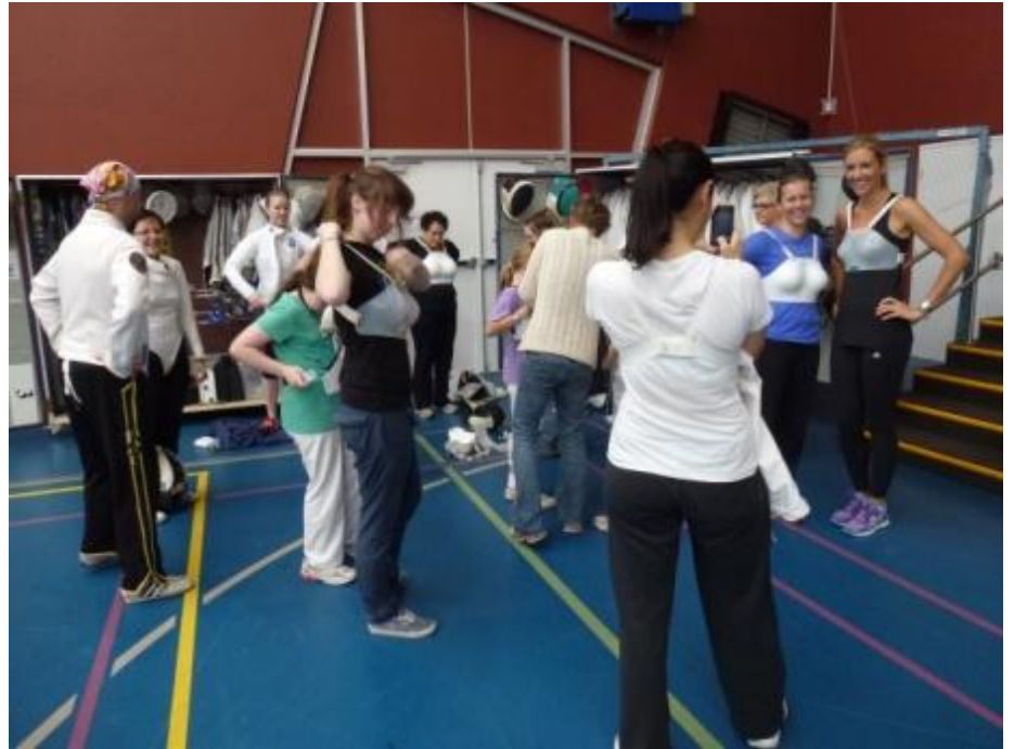
Fun Bra photo